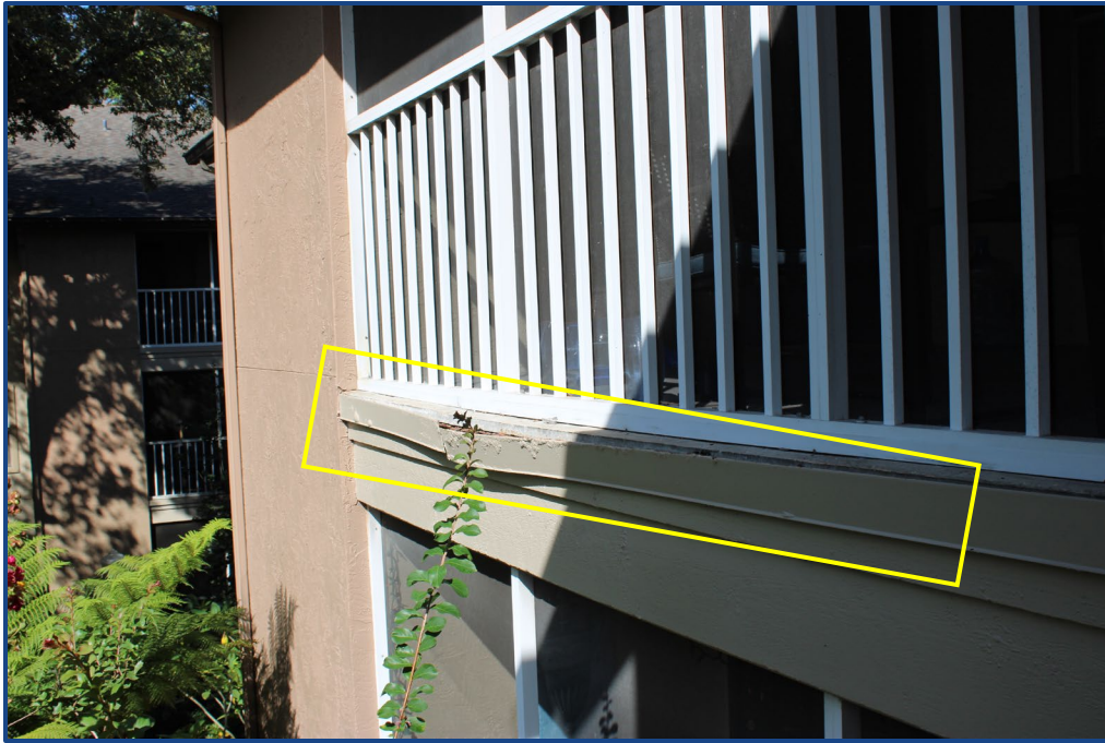
Photograph No. 11: Corrosion and separation of the metal flashing at the edge of the balcony slab on Unit 308.