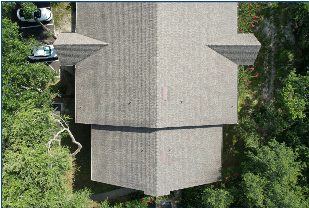
Photograph No. 8: View of the west roof section.