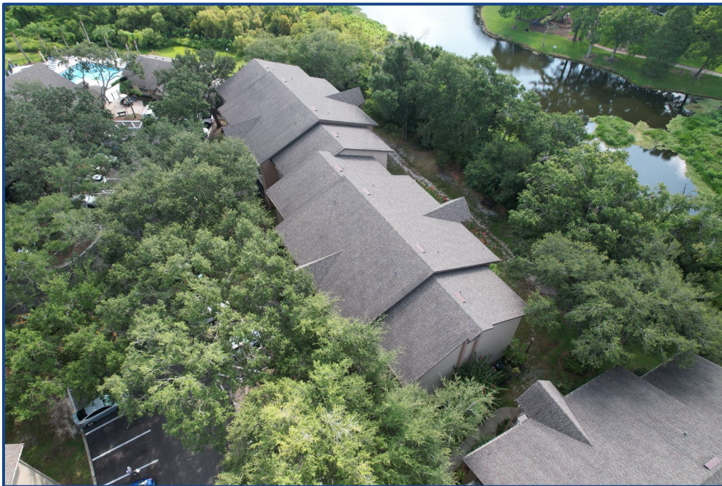
Photograph No. 2: West elevation.