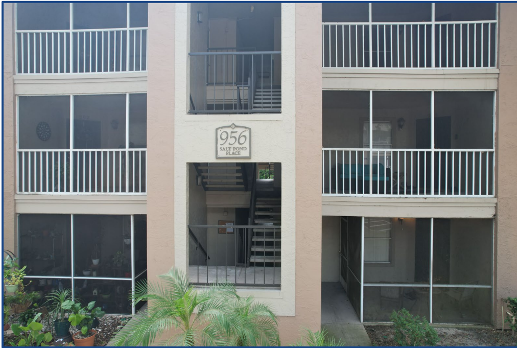
Photograph No. 10: View of the balconies and stairway on the northwest side of the building.