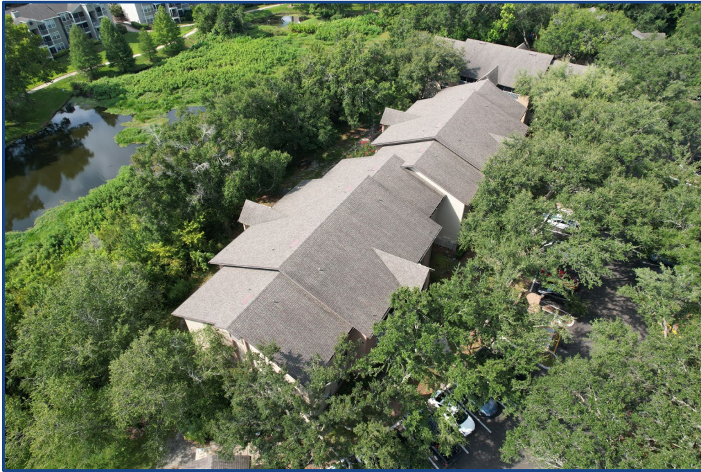
Photograph No. 1: North elevation.