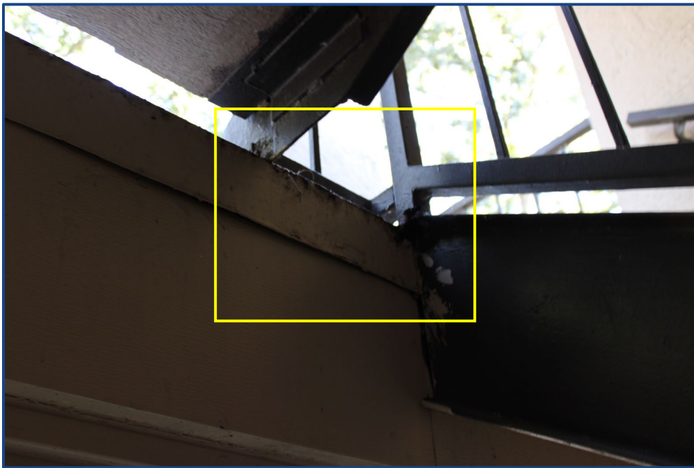
Photograph No. 18: Corrosion to the steel framing and metal flashing located in the northeast stairway.