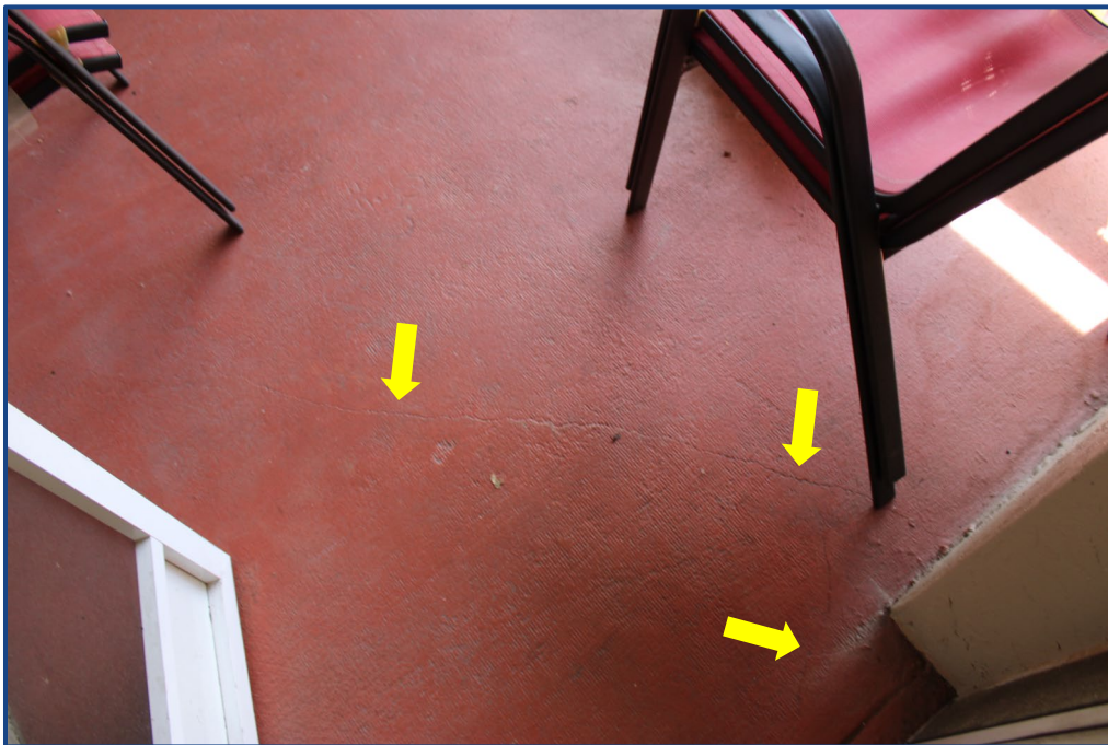
Photograph No. 16: Cracks in the concrete balcony slab on Unit 307.