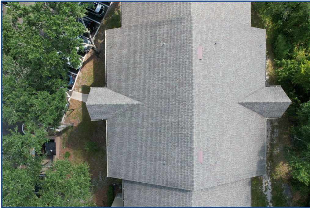
Photograph No. 6: View of the east roof section.