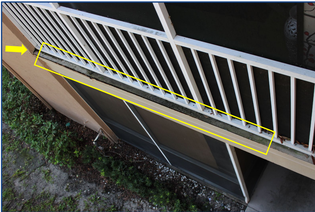
Photograph No. 12: Cracks in the stucco wall finish and corrosion and separation of the metal flashing at the edge of the balcony slab on Unit 204.