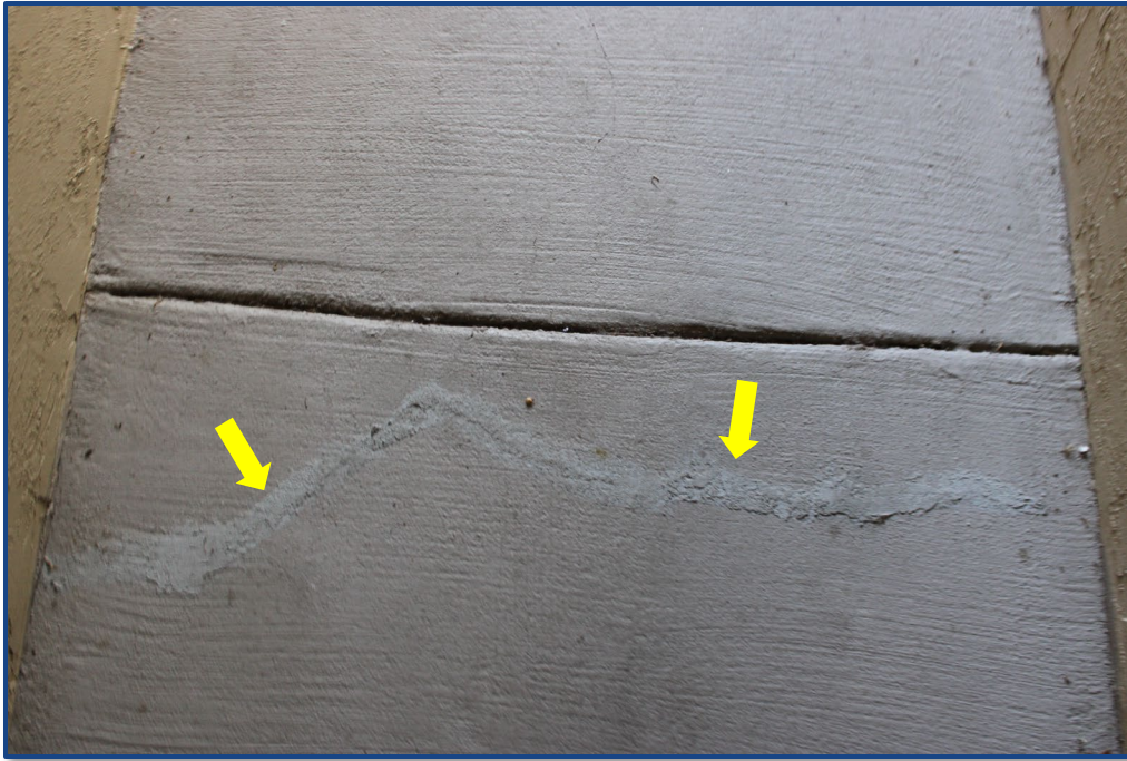
Photograph No. 15: Previously sealed crack in the concrete slab located in the 2nd floor breezeway.