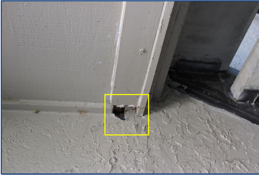
Photograph No. 13: Damage to the stucco wall finish located in the southwest stairway.