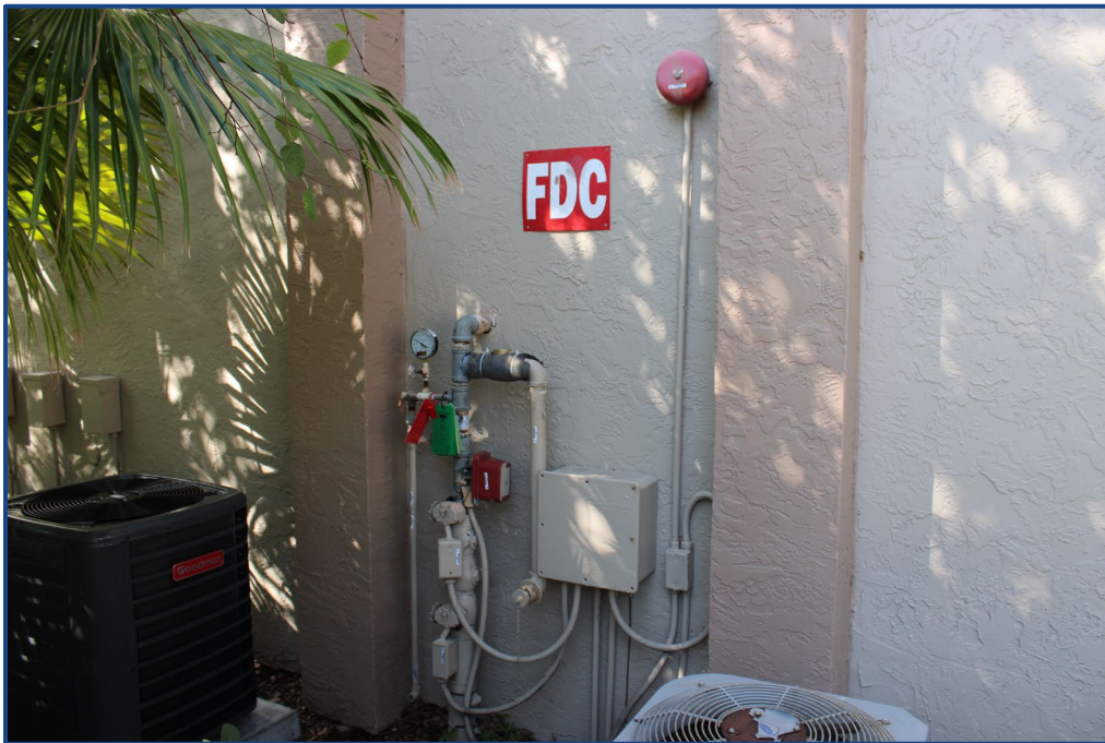
Photograph No. 22: Fire riser system and fire alarm.