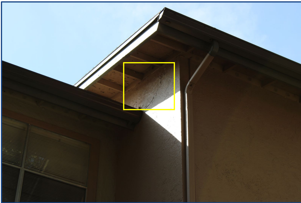
Photograph No. 14: Previous stucco repair.