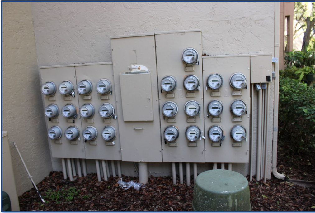
Photograph No. 21: Electrical meters.