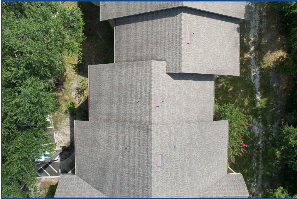
Photograph No. 7: View of the west roof.