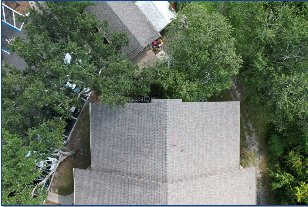
Photograph No. 5: View of the east roof section.