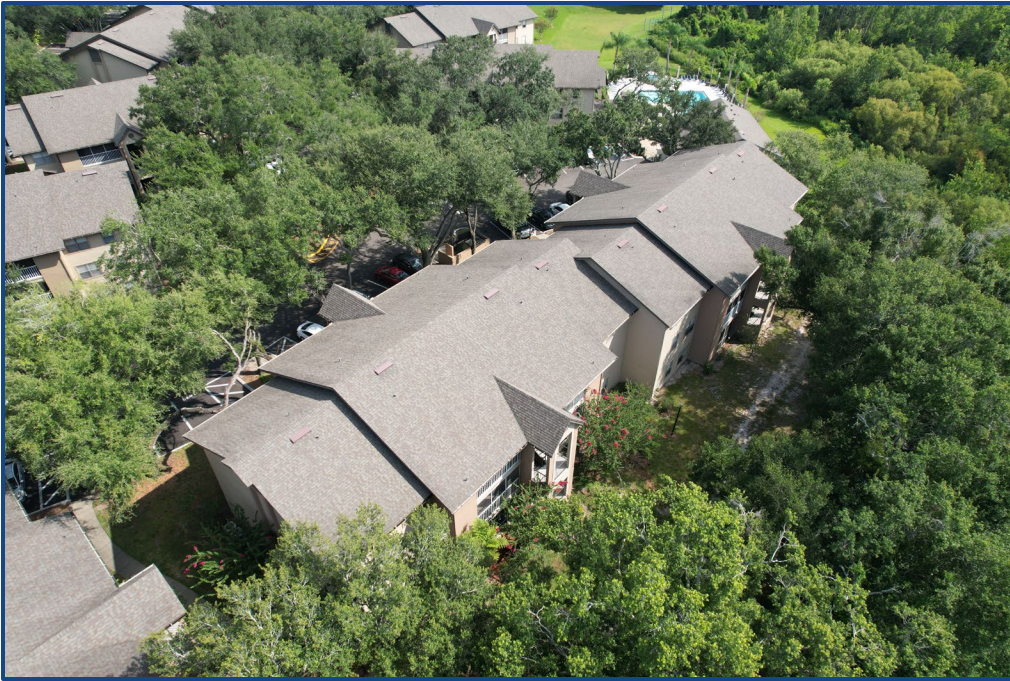
Photograph No. 3: South elevation.