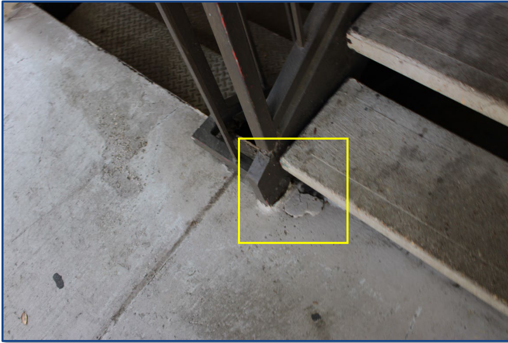
Photograph No. 17: Cracks and spalling in the concrete stairway landing and corrosion to the steel framing in the northwest stairway.