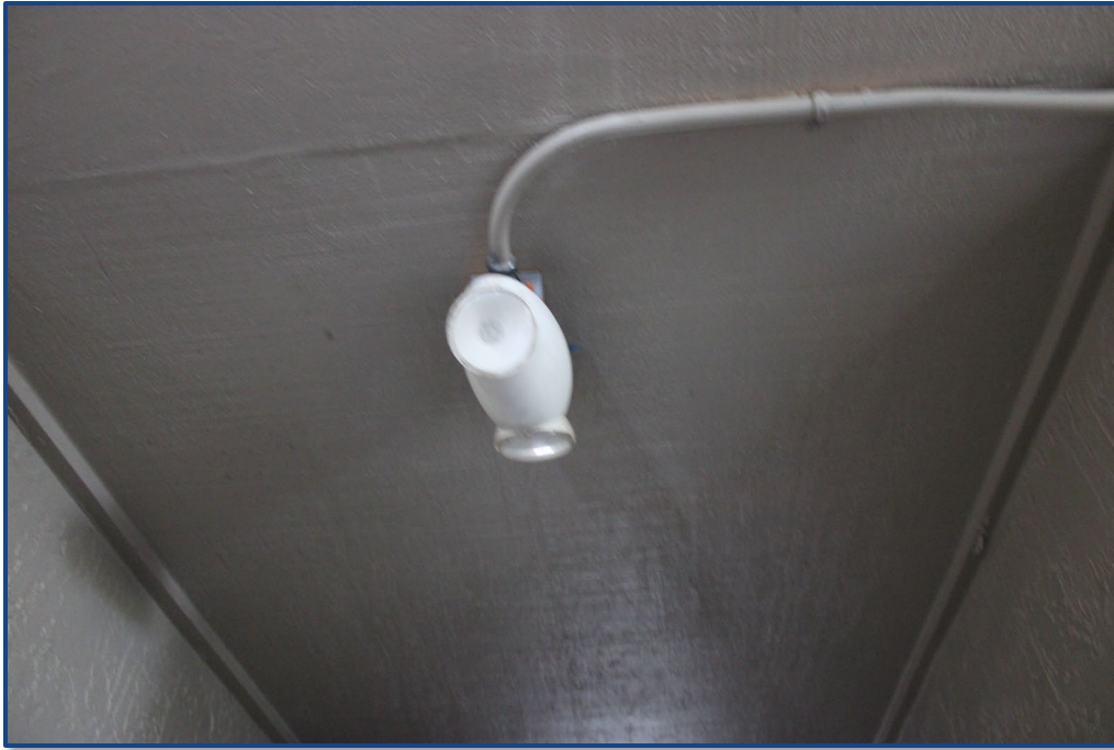
Photograph No. 23: Emergency lighting.