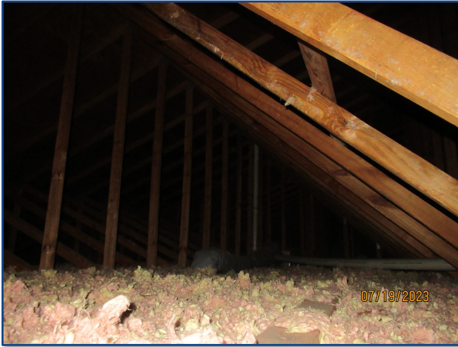
Photograph No. 9: General view of the prefabricated wooden roof trusses.