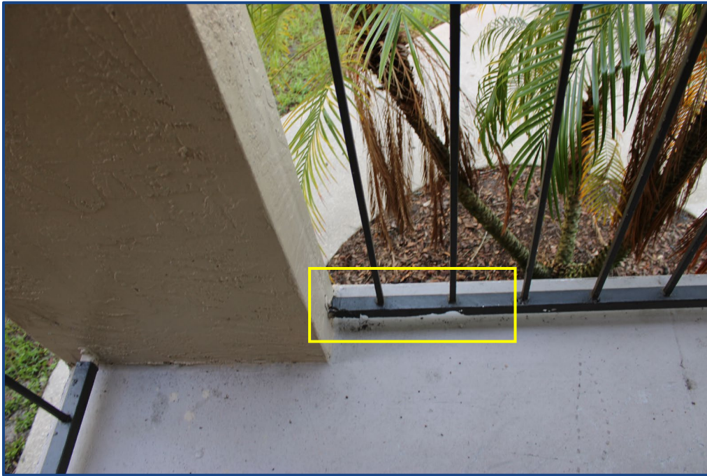
Photograph No. 20: Corrosion to the metal handrail located in the northeast stairway.