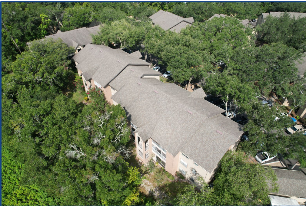
Photograph No. 4: East elevation.