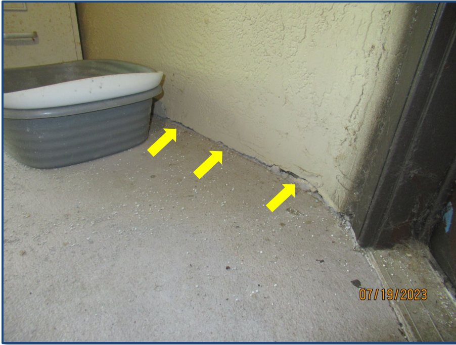
Photograph No. 9: Damage to the exterior wall stucco finish located on the balcony of Unit 302.