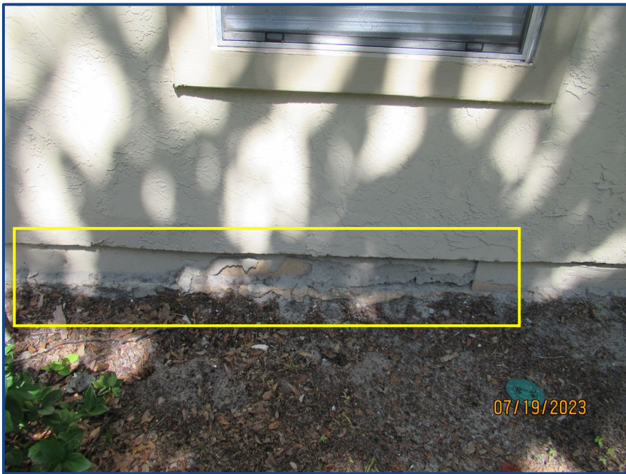
Photograph No. 10: Damage to the exterior wall stucco finish located on the east side of the building.