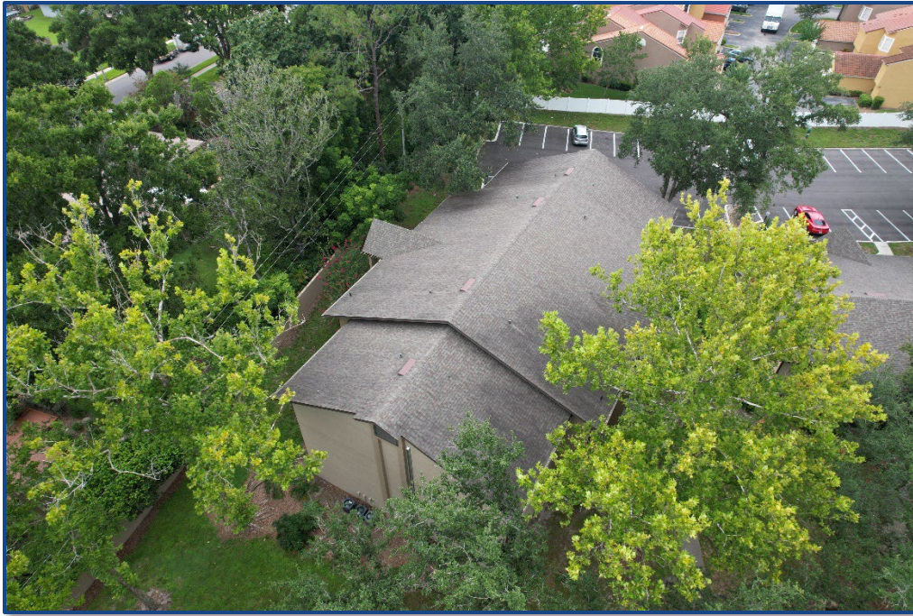
Photograph No. 3: South elevation.