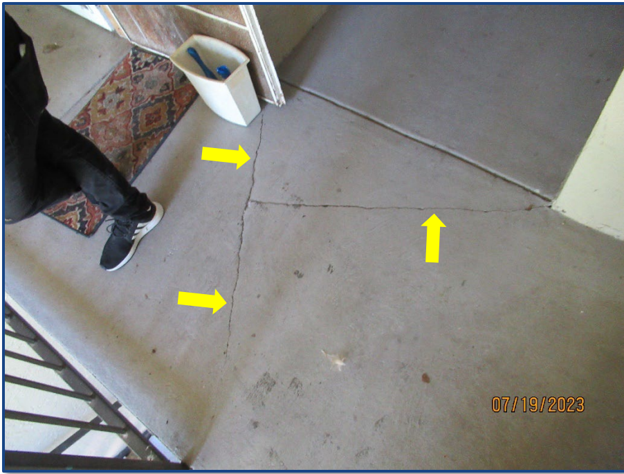
Photograph No. 15: Cracks in the concrete slab located on the 3rd floor.