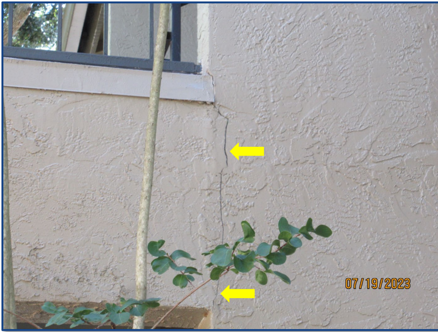
Photograph No. 13: Crack in the exterior wall stucco finish located on the west stairway.