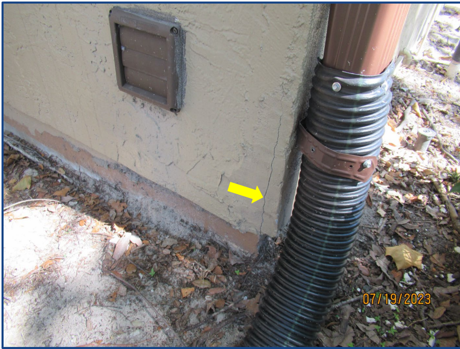
Photograph No. 11: Crack in the exterior wall stucco finish located on the east side of the building.