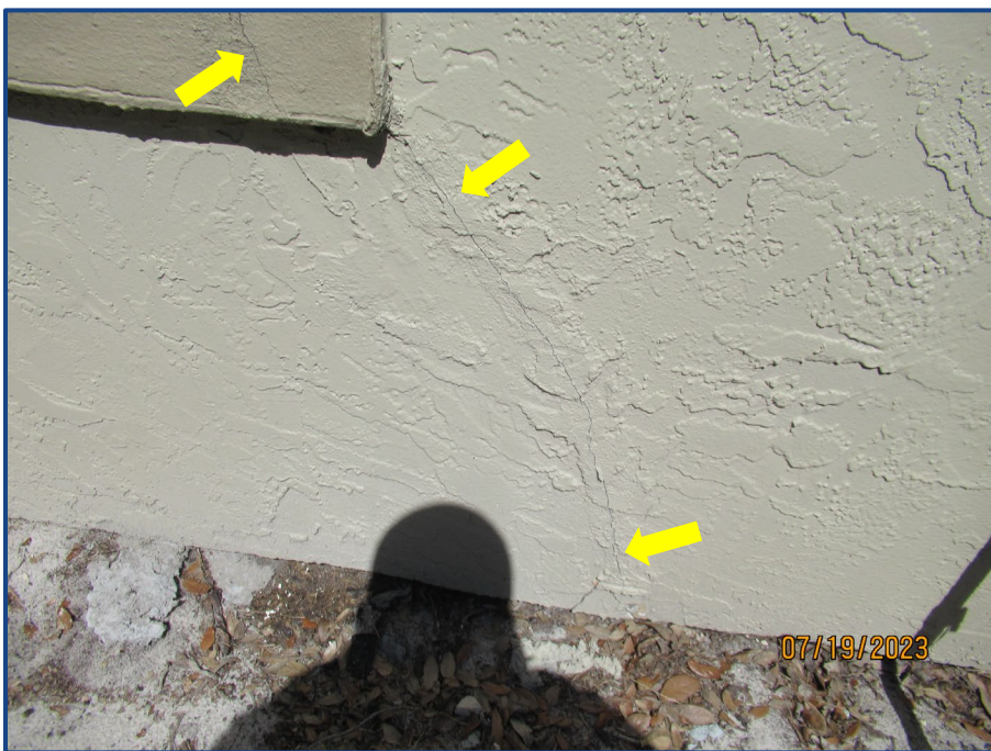
Photograph No. 12: Cracks in the exterior wall stucco finish located on the east side of the building.