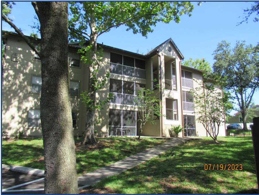
Photograph No. 8: View of the balconies and stairway on the east side of the building.