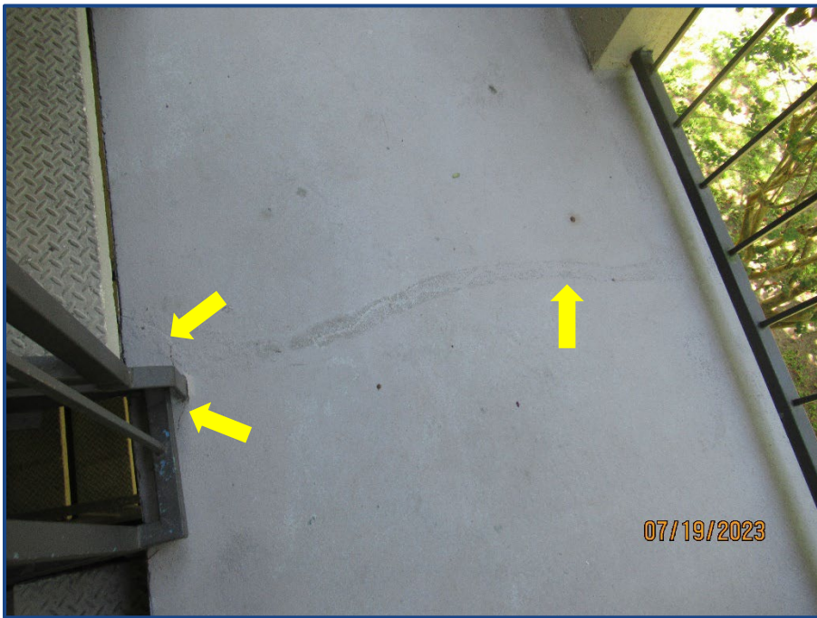
Photograph No. 14: Previously sealed cracks in the stairway landing located in the west stairway.