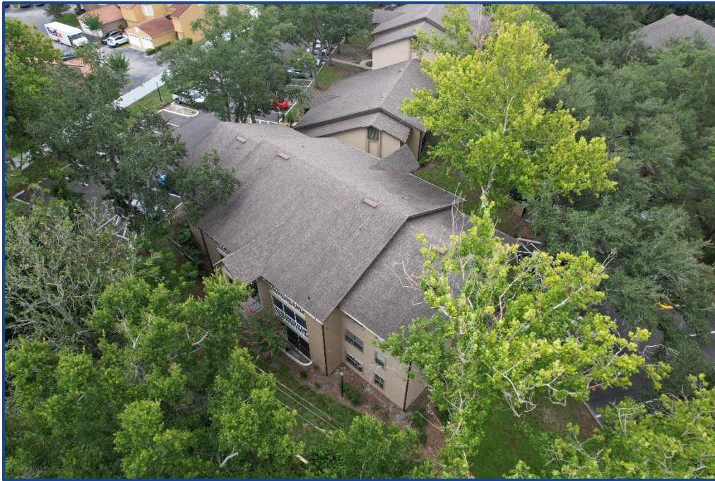
Photograph No. 2: West elevation.