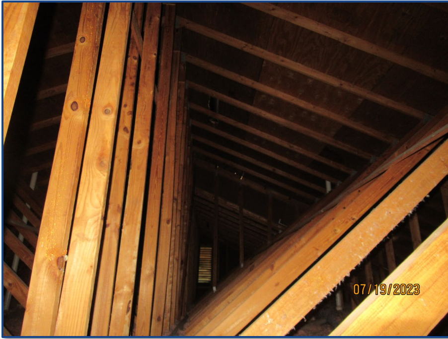
Photograph No. 7: General view of the prefabricated wooden roof trusses.