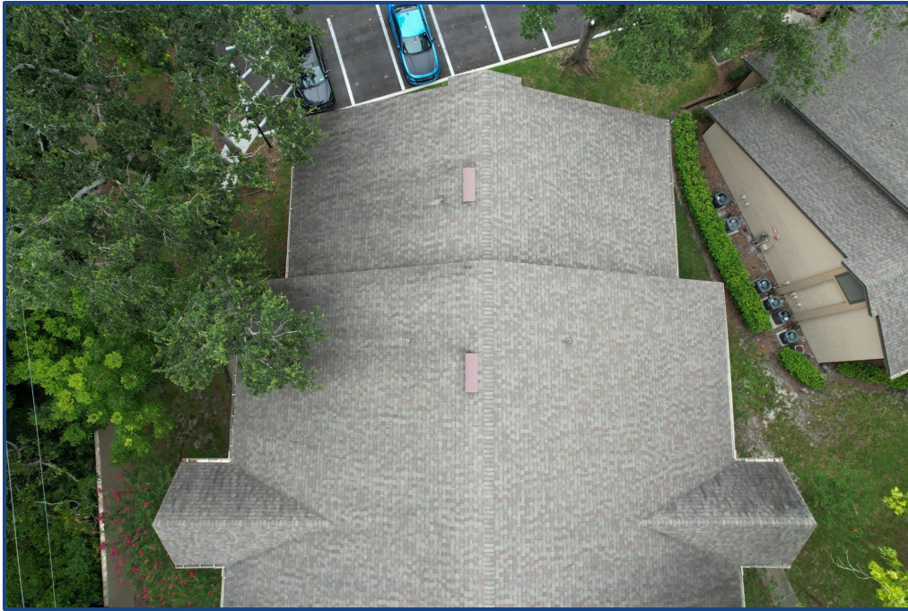
Photograph No. 5: View of the north roof section.