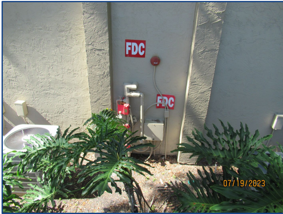
Photograph No. 19: Fire riser system and fire alarm.