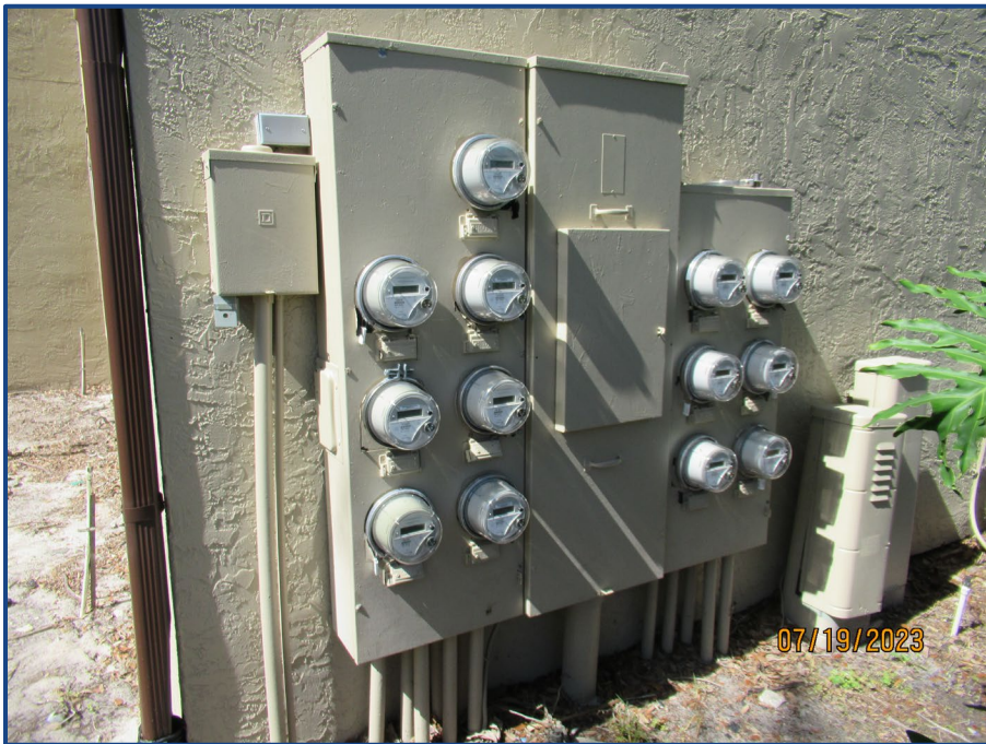
Photograph No. 18: Electrical meters.