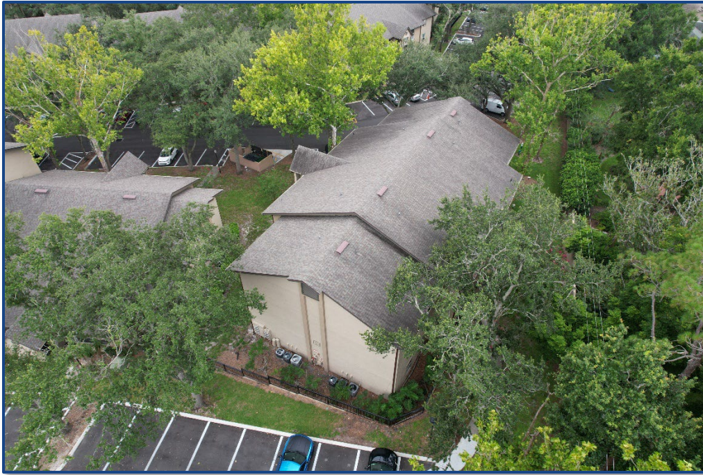
Photograph No. 1: North elevation.