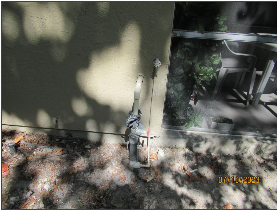
Photograph No. 17: Plumbing.