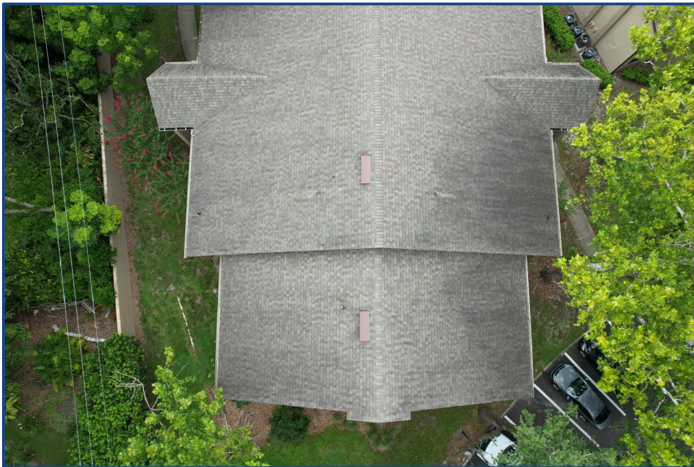
Photograph No. 6: View of the south roof section.