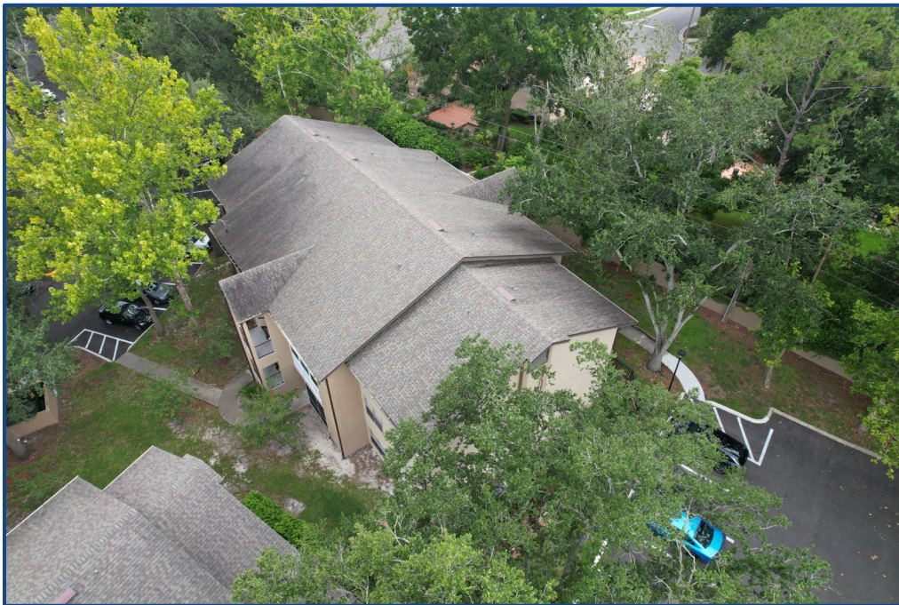
Photograph No. 4: East elevation.