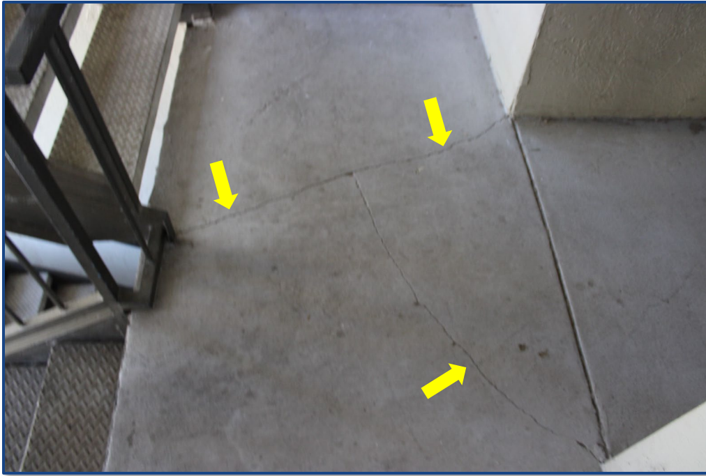
Photograph No. 17: Cracks in the concrete slab located on the 2nd floor.