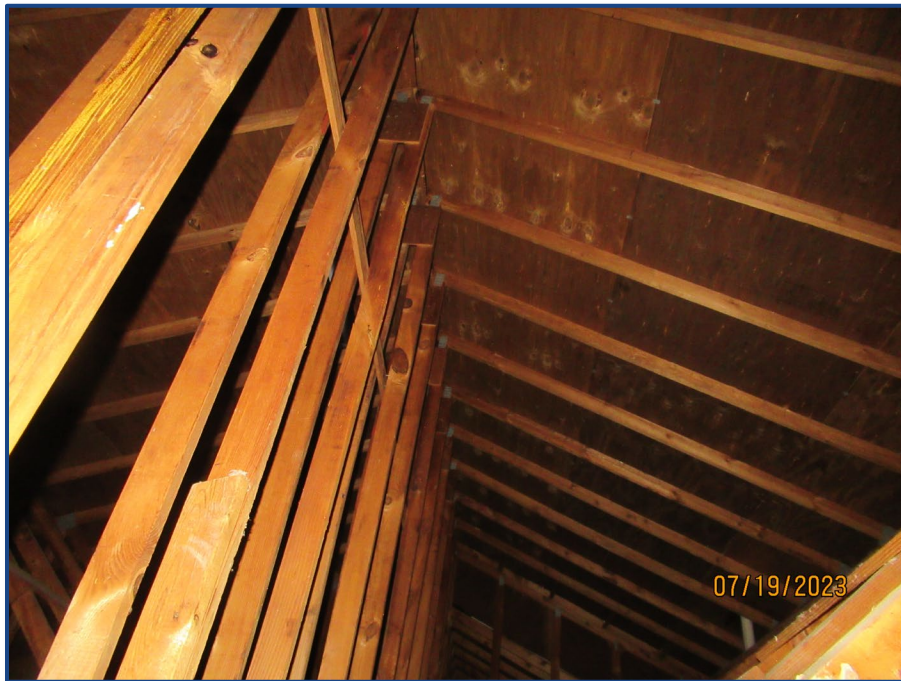
Photograph No. 8: General view of the prefabricated wooden roof trusses.