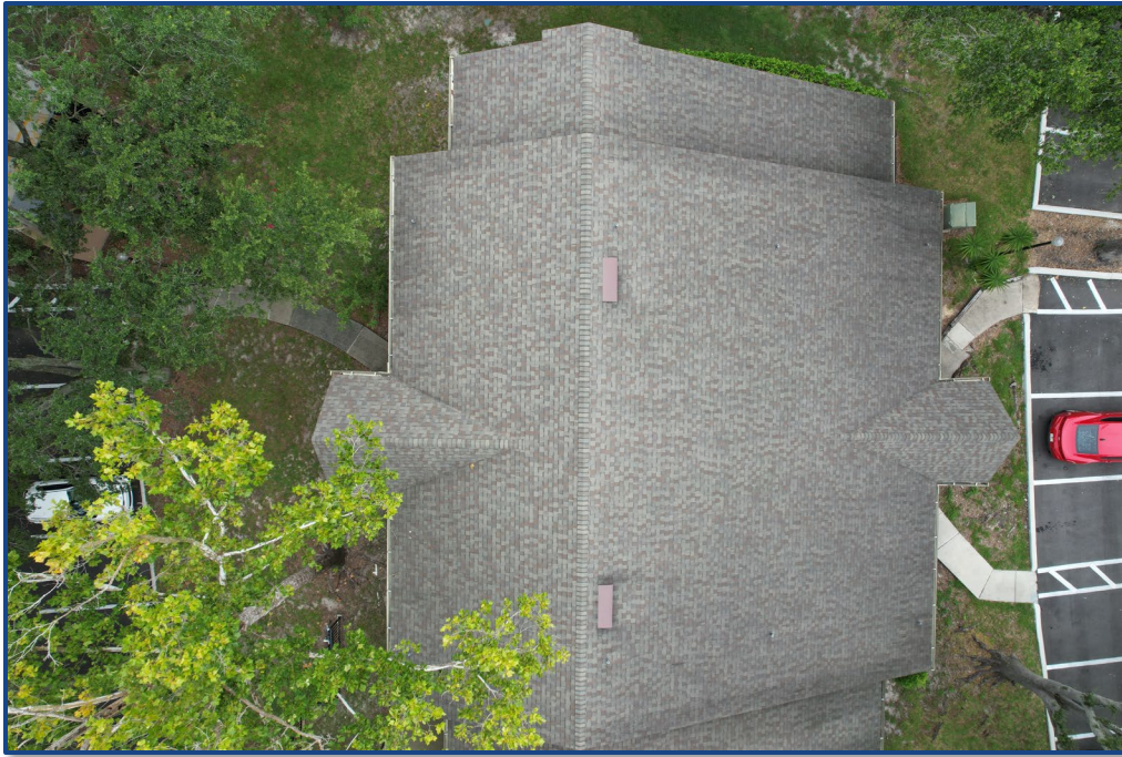
Photograph No. 5: View of the west roof section.