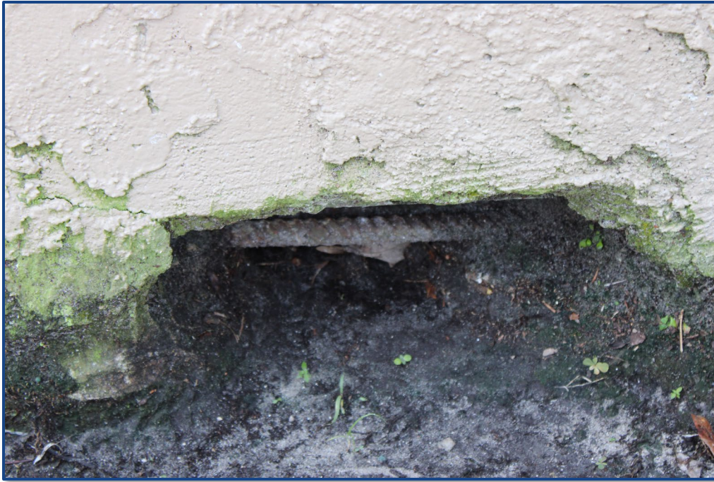
Photograph No. 19: Exposed reinforcement steel located in the drainage scupper located in the northeast stairway.