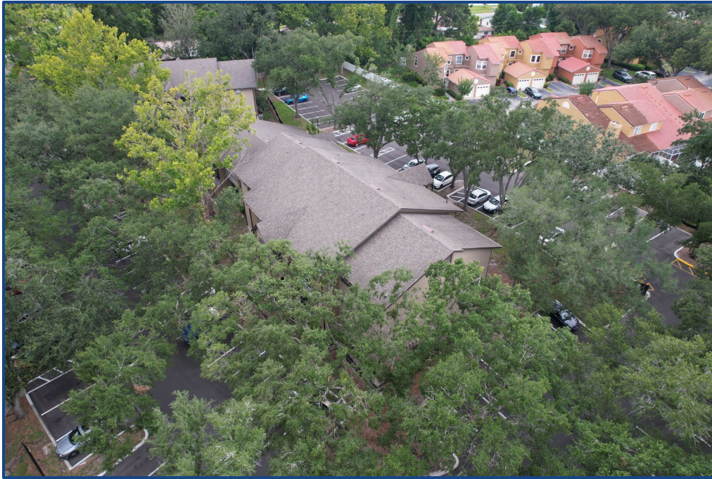
Photograph No. 3: South elevation.