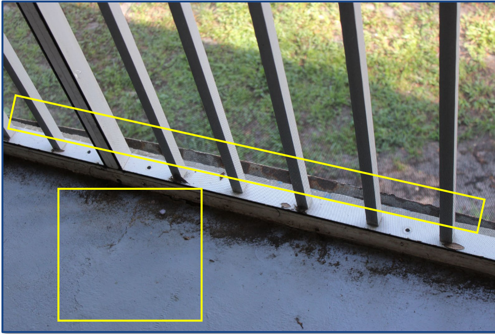
Photograph No. 13: Peeling of the balcony slab paint finish and corrosion and separation of the metal flashing at the edge of the balcony slab on Unit 203.