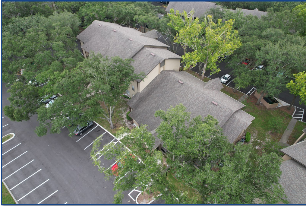
Photograph No. 1: North elevation.