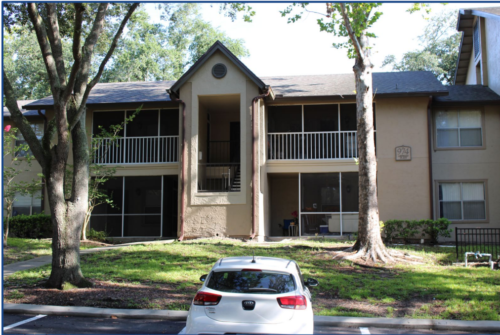
Photograph No. 10: View of the balconies and stairway on the southwest side of the building.