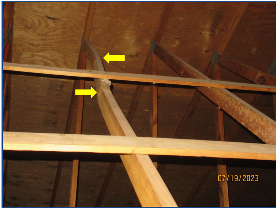
Photograph No. 9: A broken roof truss located in the east roof section attic.