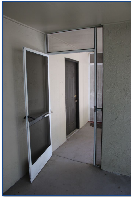
Photograph No. 21: View of the storage room door.