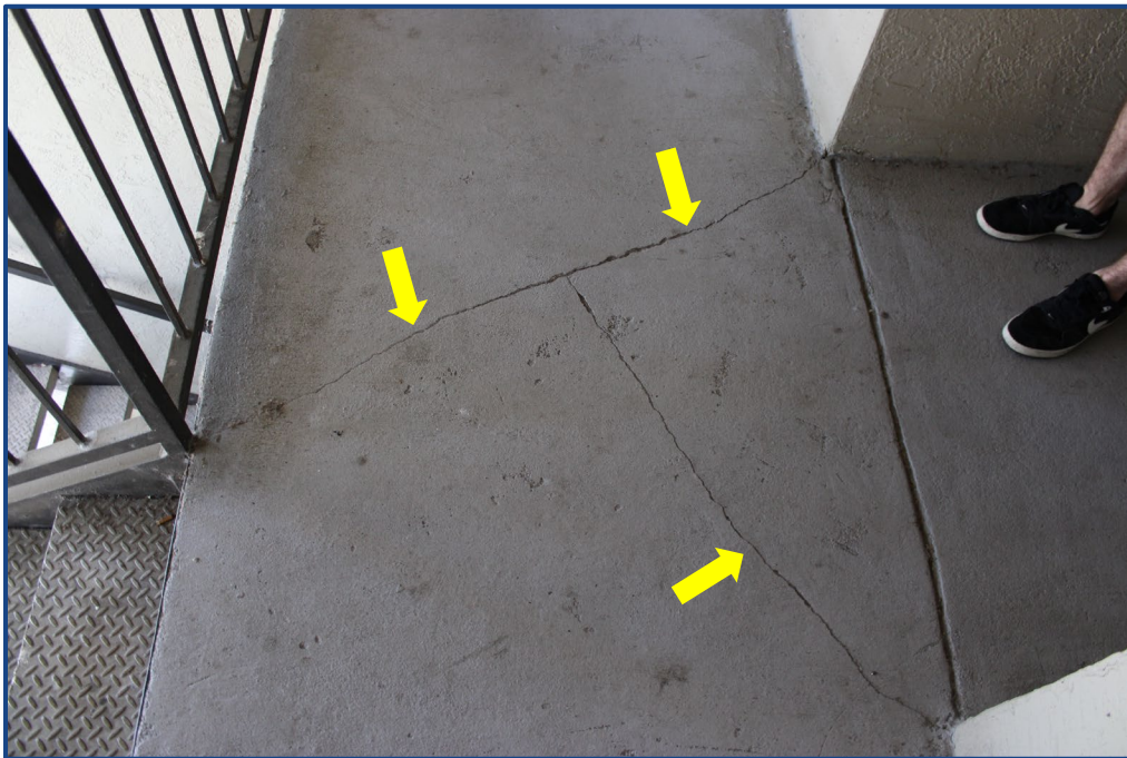
Photograph No. 18: Cracks in the concrete slab located on the 3rd floor