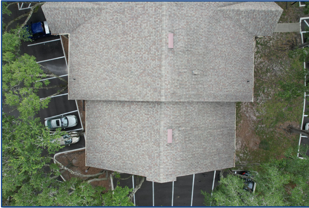
Photograph No. 7: View of the east roof section.