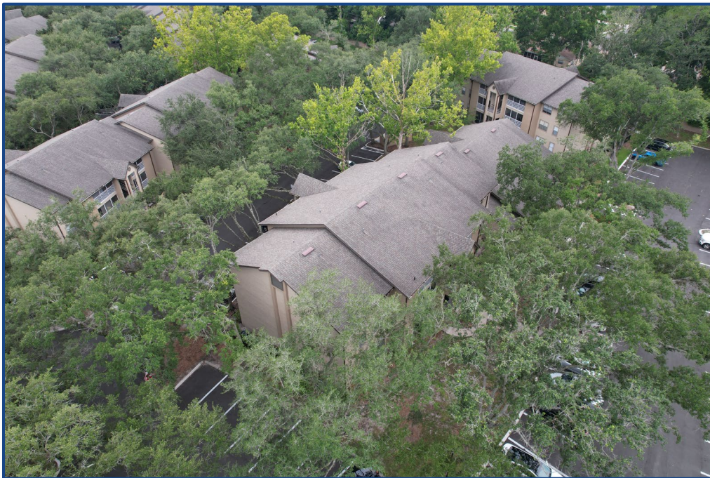
Photograph No. 4: East elevation.