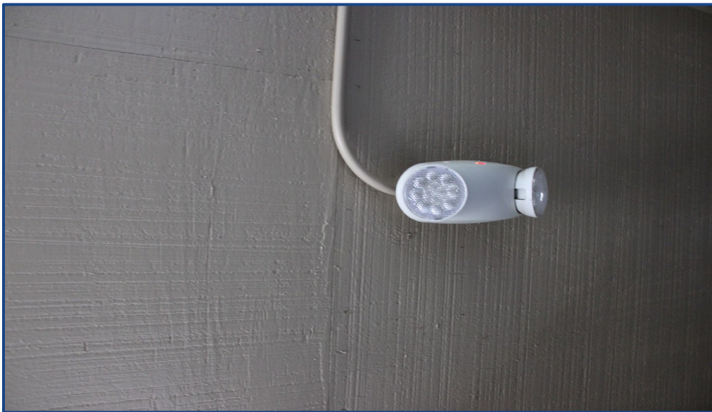
Photograph No. 20: Emergency lighting fixture.