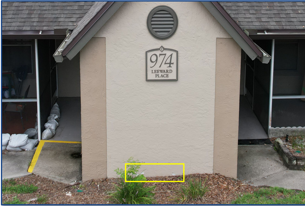
Photograph No. 15: Peeling of the exterior wall paint finish located on the northwest side of the building.