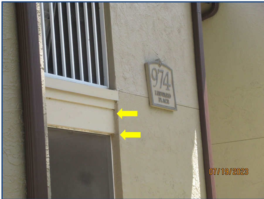
Photograph No. 16: Cracks in the exterior wall stucco finish on the southwest side of the building.