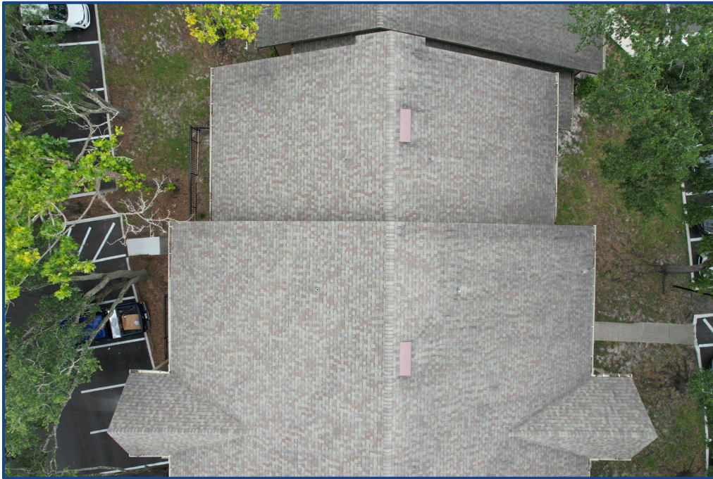
Photograph No. 6: View of the central roof section.