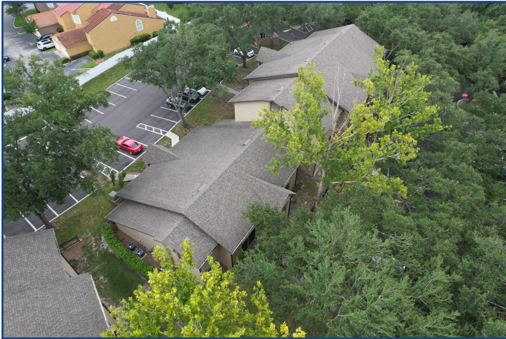
Photograph No. 2: West elevation.