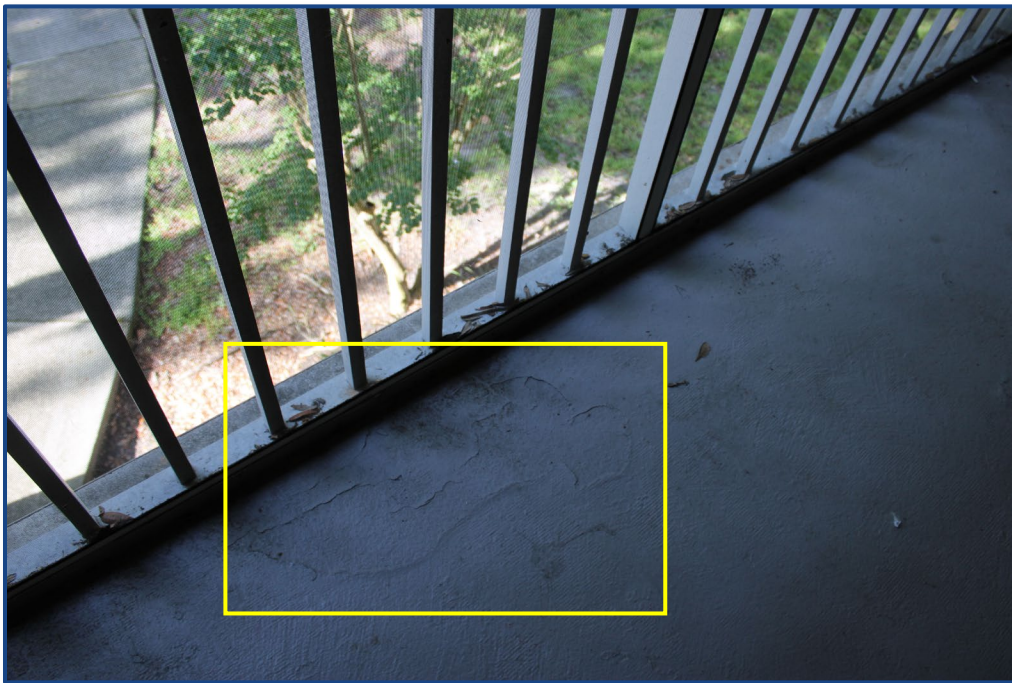
Photograph No. 14: Peeling of the balcony slab paint finish located on Unit 208.