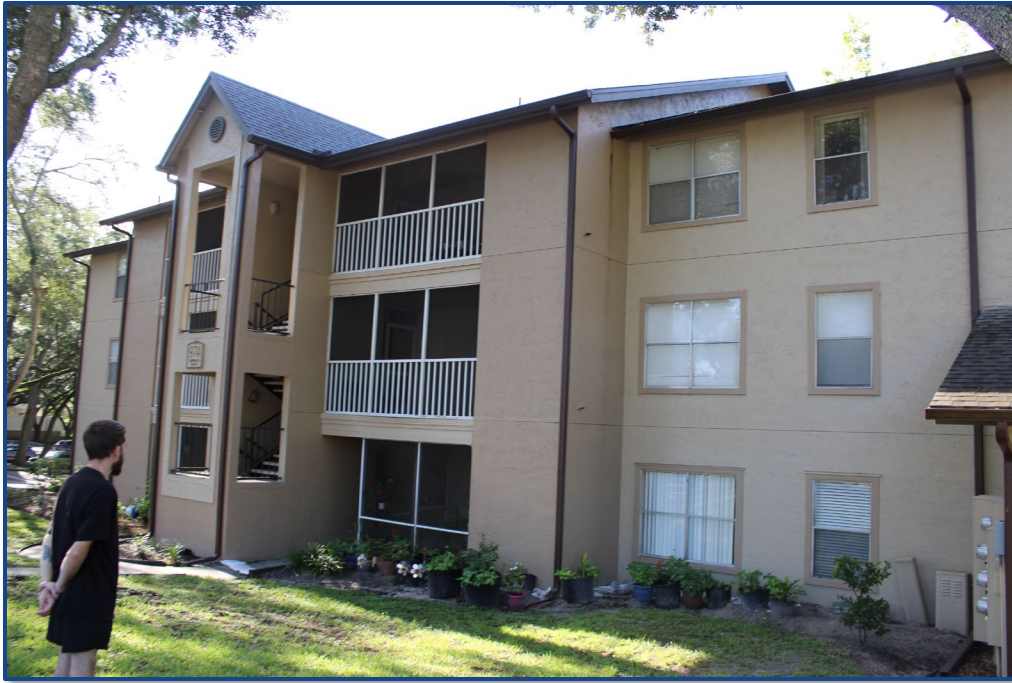
Photograph No. 11: View of the balconies and stairway on the northeast side of the building.