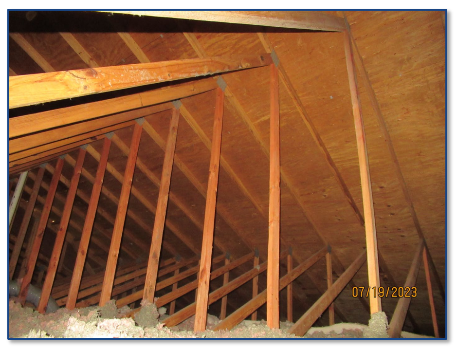
Photograph No. 7: General view of the prefabricated wooden roof trusses.