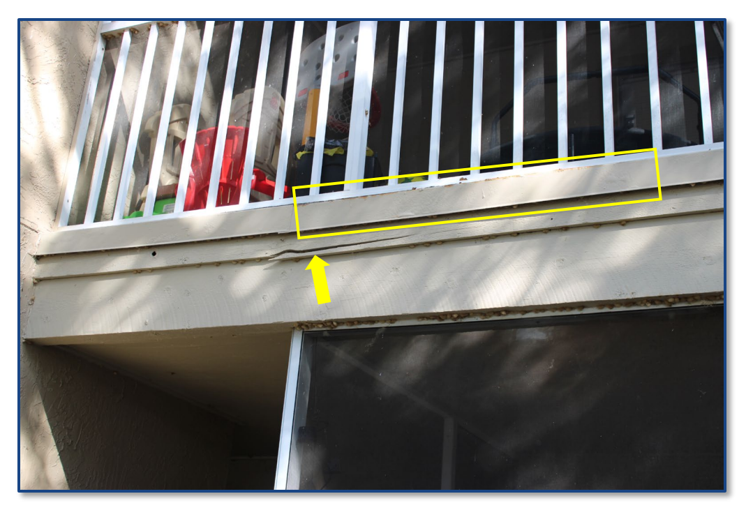
Photograph No. 9: A cracked decorative board and corrosion and separation of the metal flashing located at the balcony edge on Unit 203.