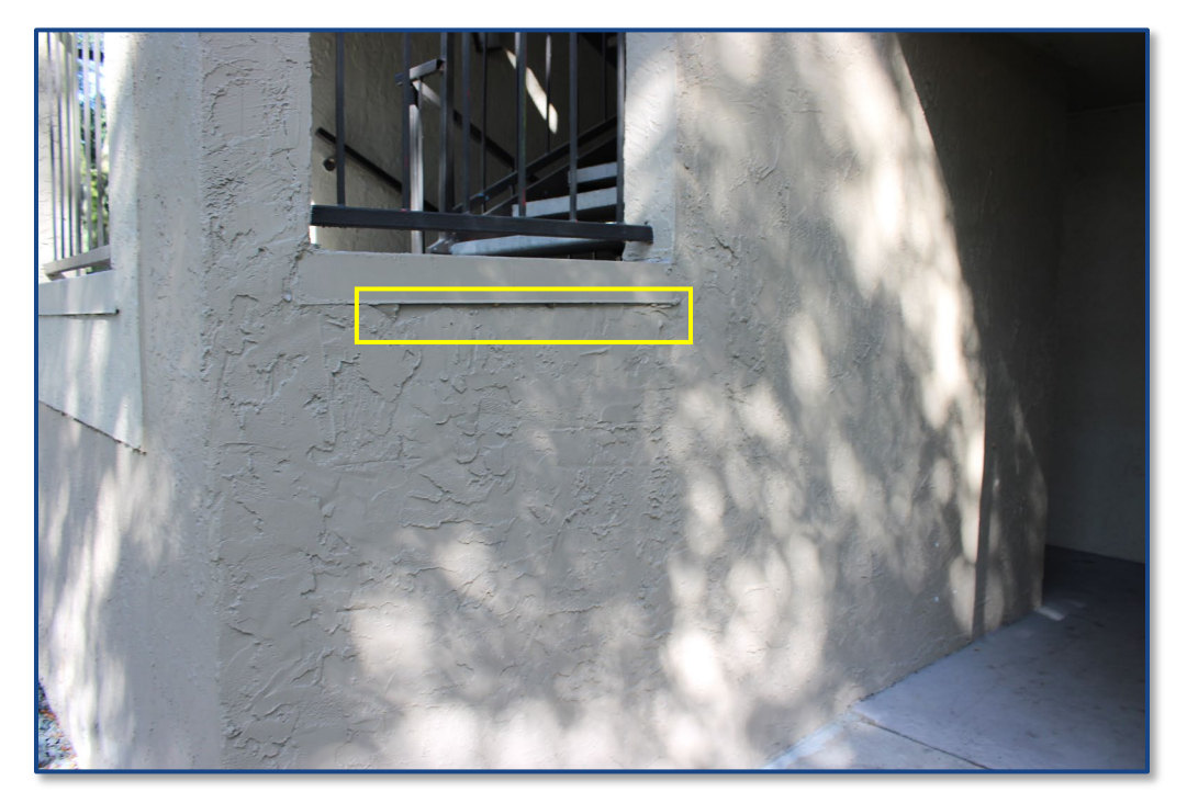
Photograph No. 10: Damage to the exterior wall stucco finish located on the south stairway.

The Landing Condominiums – Building 15 642 Dory Lane Altamonte Springs, Seminole County, Florida 32714