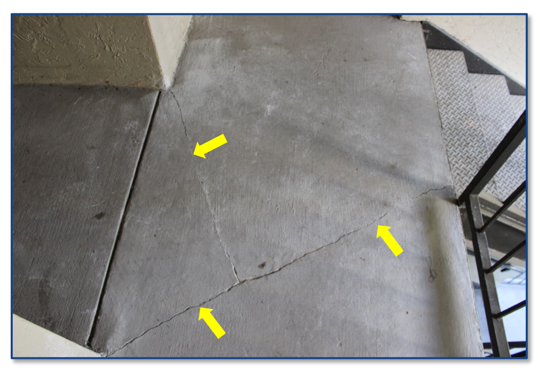
Photograph No. 14: Cracks in the concrete slab located on the 3rd floor.

The Landing Condominiums – Building 15 642 Dory Lane Altamonte Springs, Seminole County, Florida 32714