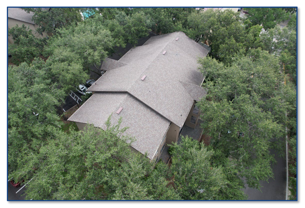
Photograph No. 1: South elevation.