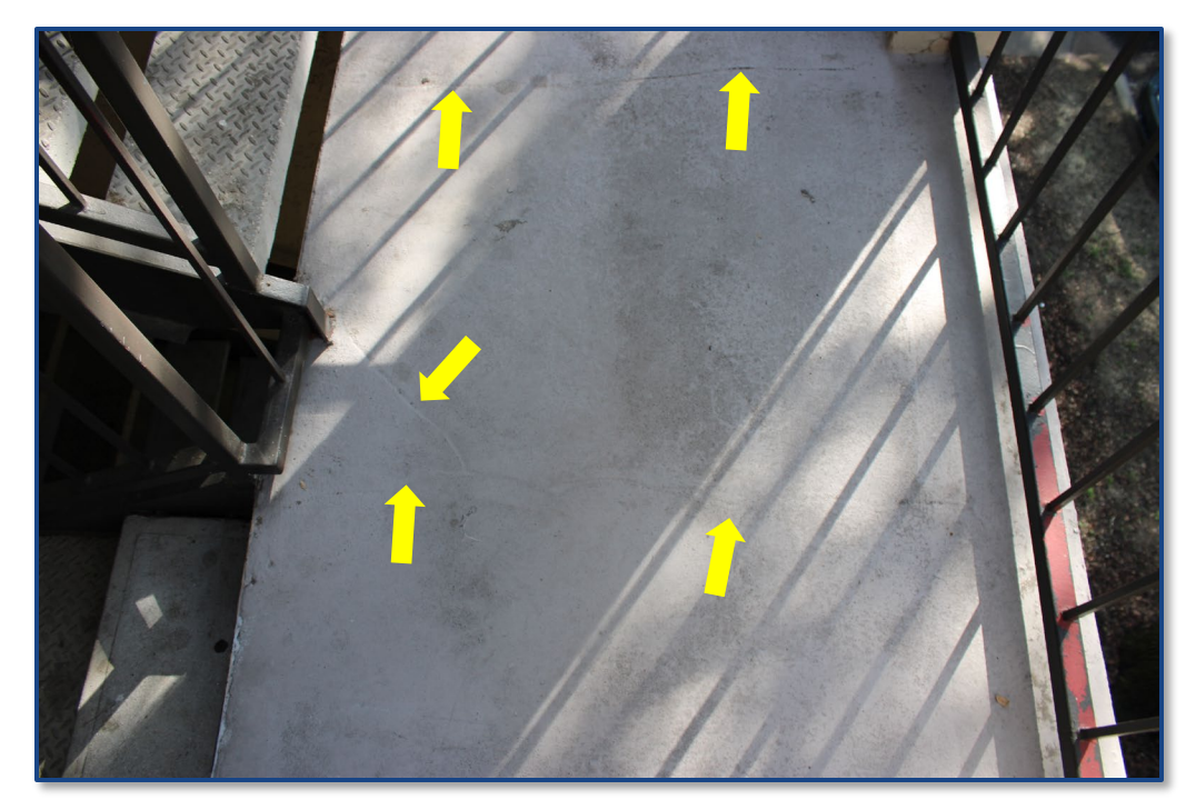
Photograph No. 15: Previously sealed cracks in the stairway landing located in the north stairway.