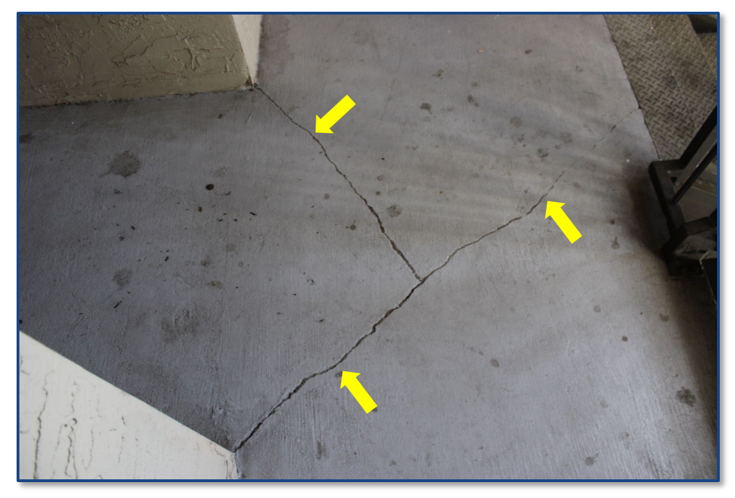
Photograph No. 13: Cracks in the concrete slab located on the 2nd floor.