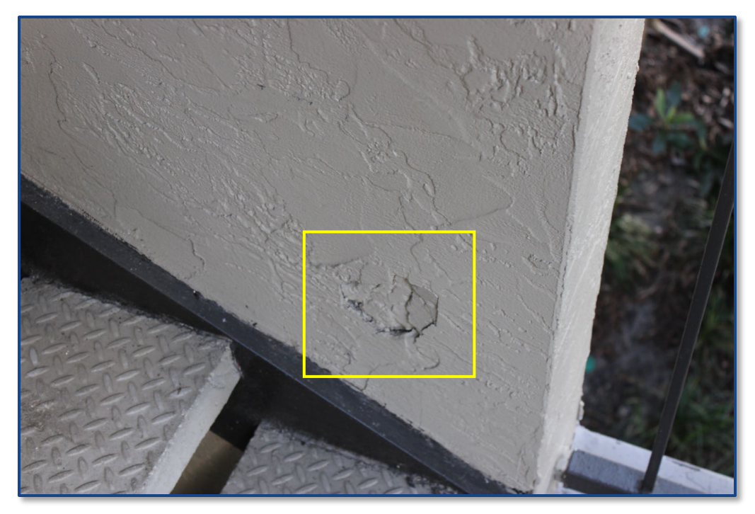
Photograph No. 11: Damage to the exterior wall stucco finish located in the south stairway.