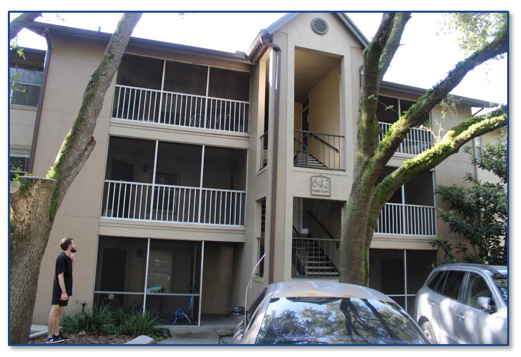
Photograph No. 8: View of the balconies and stairway on the north side of the building.

The Landing Condominiums – Building 15 642 Dory Lane Altamonte Springs, Seminole County, Florida 32714