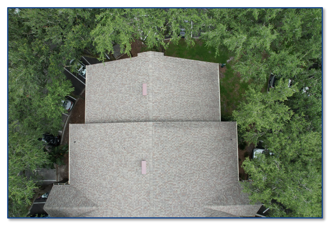
Photograph No. 5: View of the west roof section.