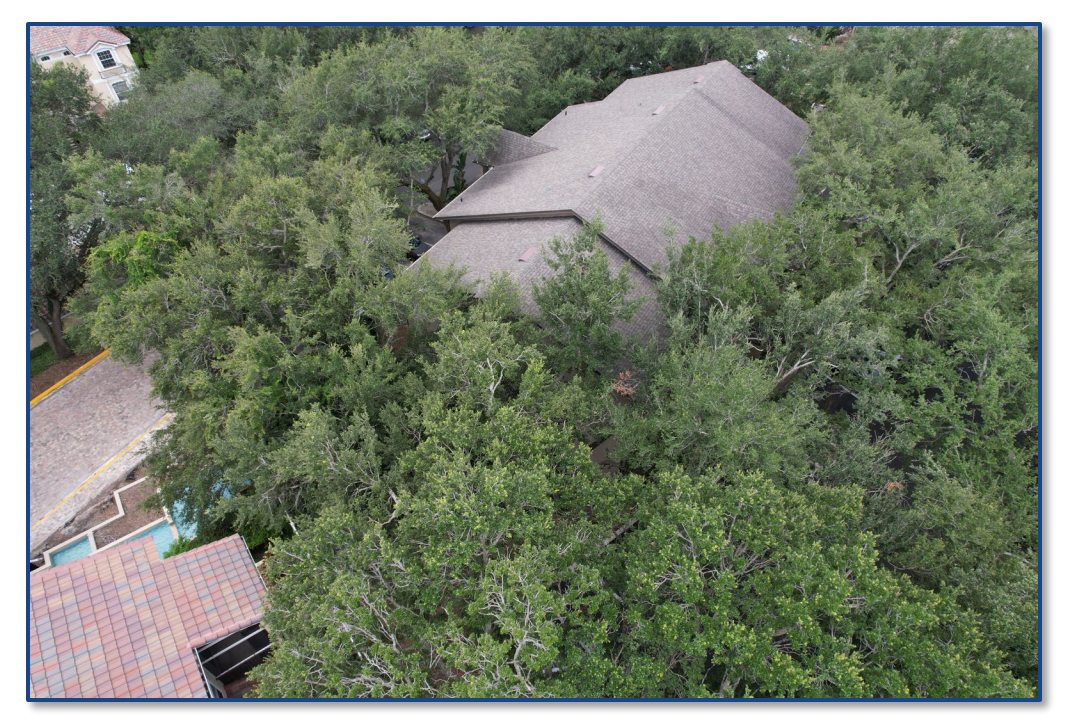
Photograph No. 3: North elevation.