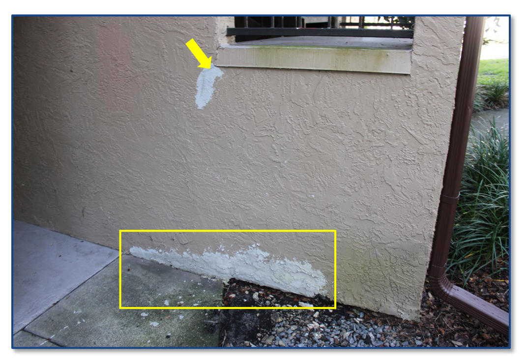
Photograph No. 12: Previous stucco repair and crack in the exterior wall stucco finish located on the north stairway.

The Landing Condominiums – Building 15 642 Dory Lane Altamonte Springs, Seminole County, Florida 32714