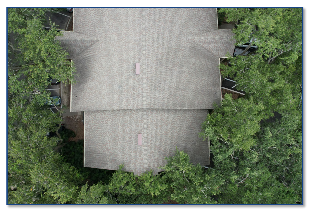
Photograph No. 6: View of the east roof section.

The Landing Condominiums – Building 15 642 Dory Lane Altamonte Springs, Seminole County, Florida 32714