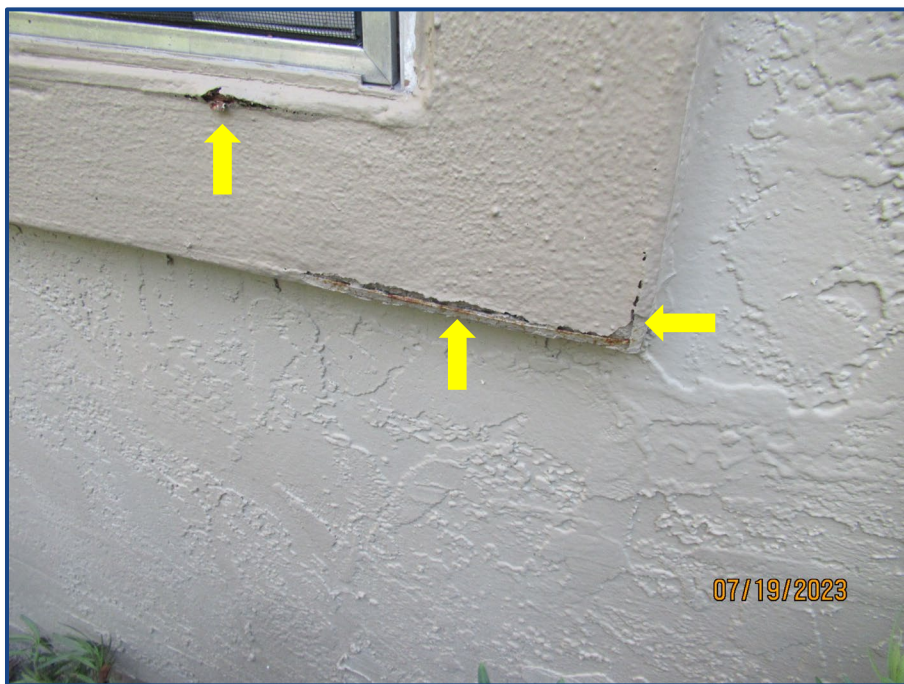
Photograph No. 10: Damage to the stucco finish around the window on Unit 101.