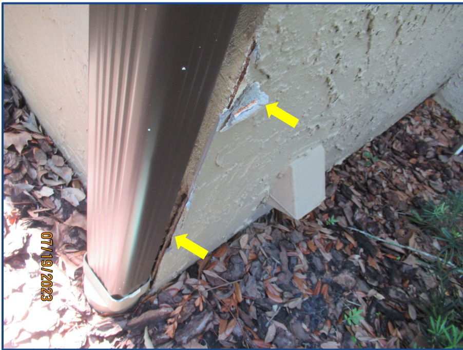
Photograph No. 8: Damage to the exterior wall stucco finish located on the northside of the building.