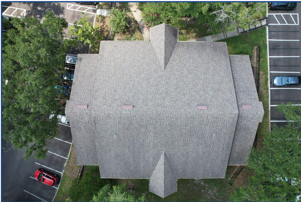
Photograph No. 4: View of the roof.