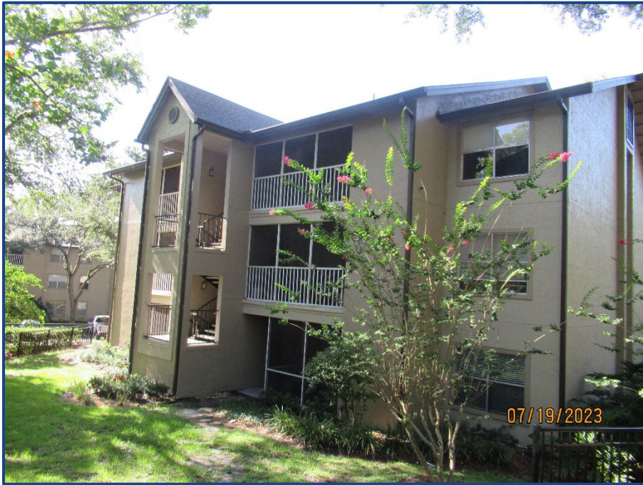
Photograph No. 6: View of the balconies and stairway on the north side of the building.