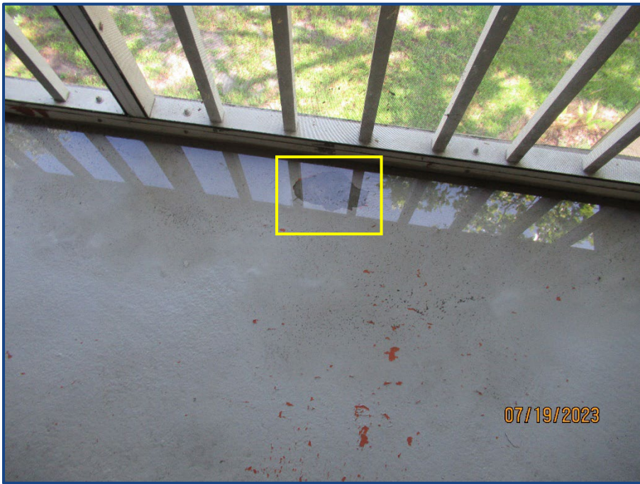
Photograph No. 12: Peeling of the balcony slab paint finish located on the balcony of Unit 303.