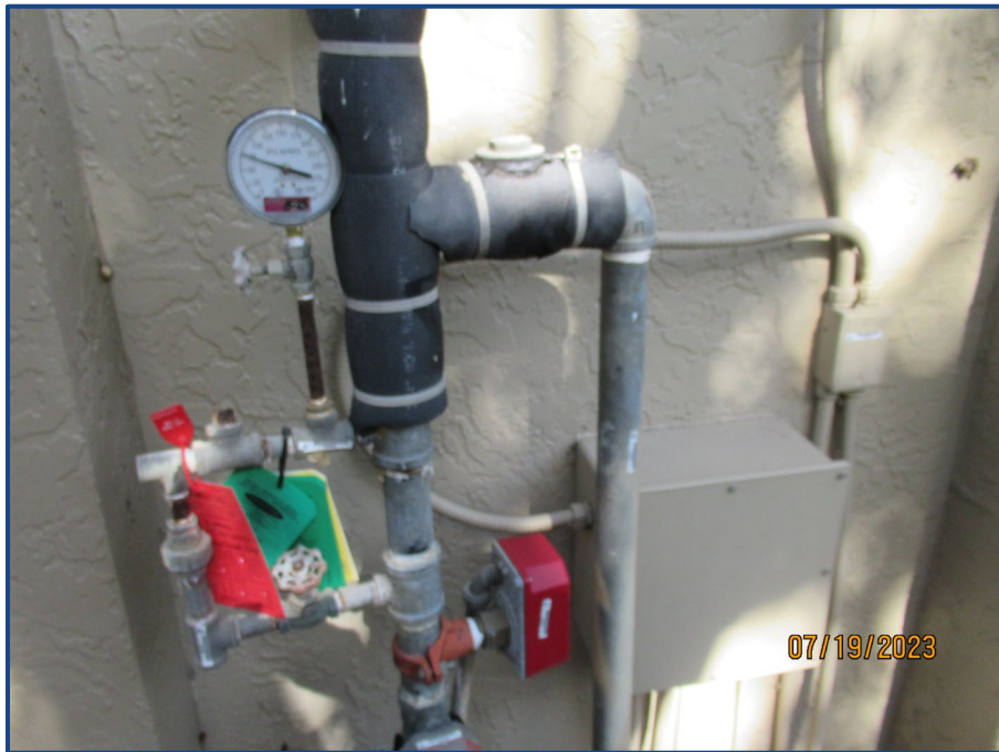
Photograph No. 20: Fire riser system.