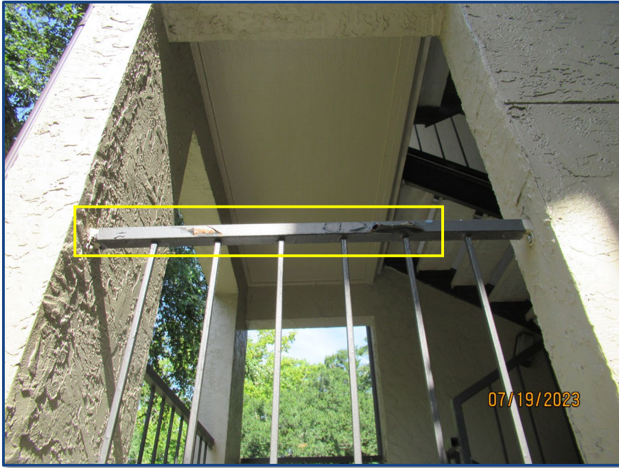
Photograph No. 17: Paint peeling and surface corrosion to the metal guardrail located in the south stairway.