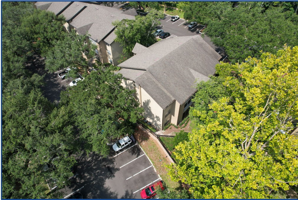
Photograph No. 3: East elevation.