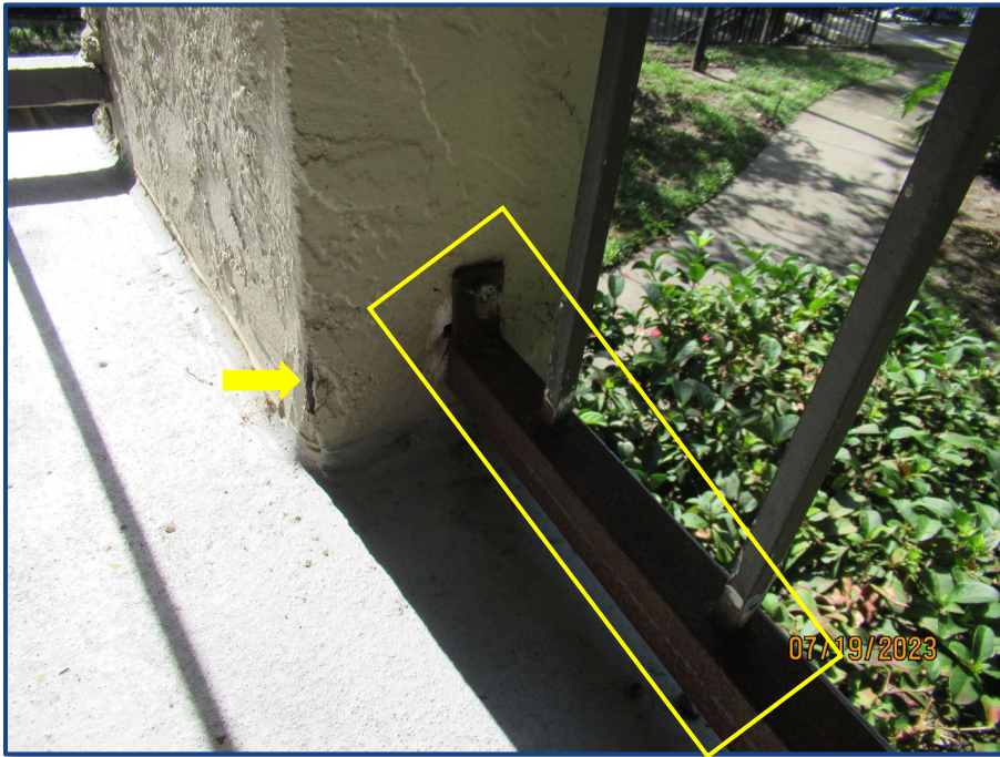
Photograph No. 18: Stucco damage, paint peeling, and surface corrosion to the metal guardrail located in the south stairway.