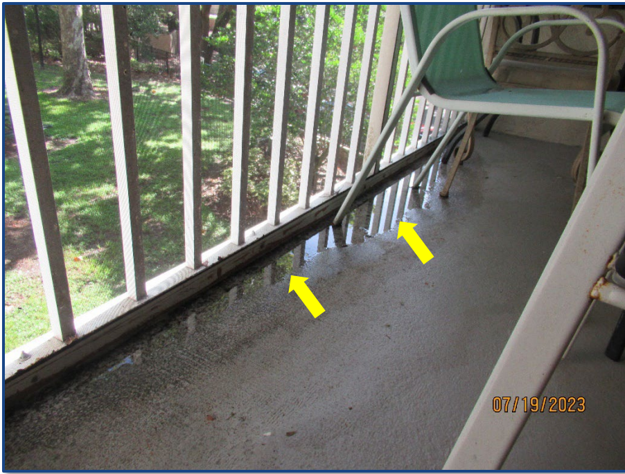
Photograph No. 11: Ponding observed on the balcony of Unit 204.