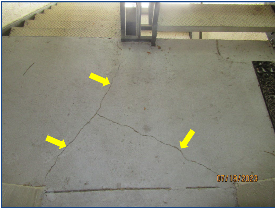
Photograph No. 14: Cracks in the concrete slab on the 2nd floor.