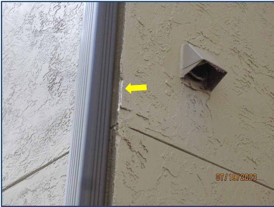
Photograph No. 7: Damage to the exterior wall stucco finish located on the northside of the building.