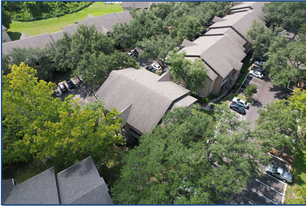
Photograph No. 1: North elevation.