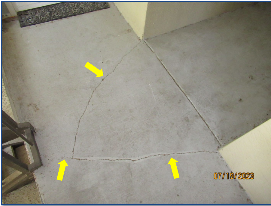
Photograph No. 13: Previously sealed cracks in the concrete slab on the 2nd floor.