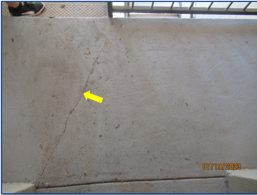
Photograph No. 15: Crack in the concrete slab located on the 3rd floor.