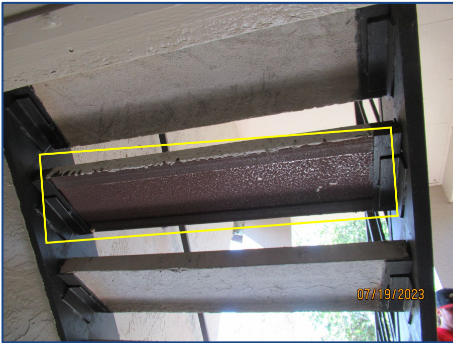
Photograph No. 16: Corrosion to the steel framing located in the south stairway.