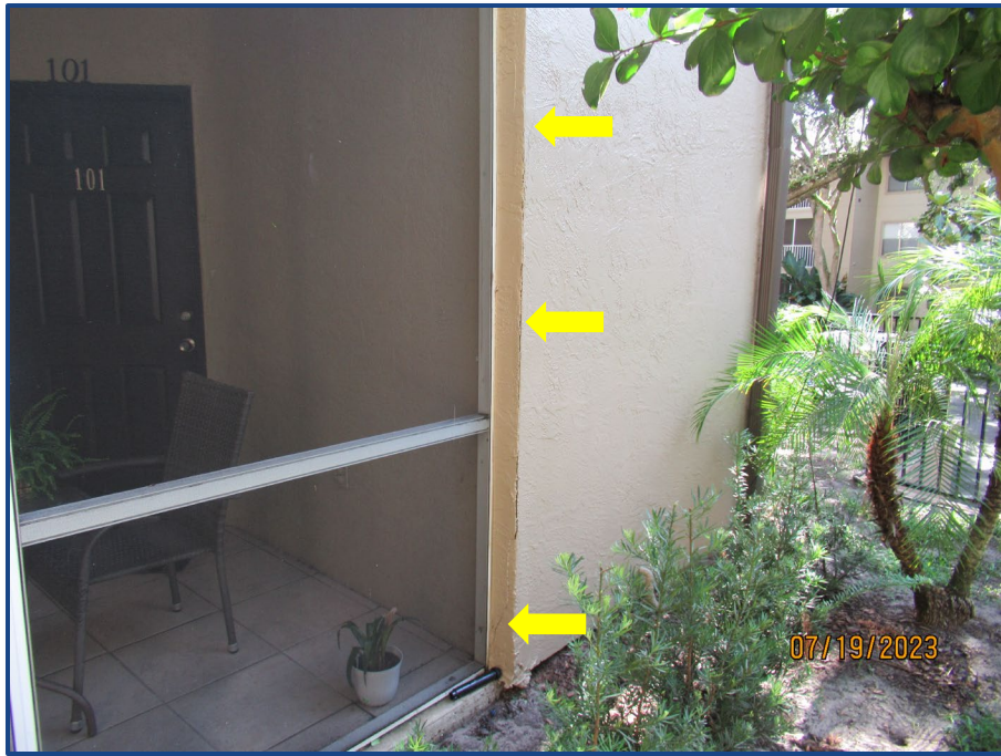
Photograph No. 9: Crack in the exterior wall stucco finish located on the exterior of Unit 101.