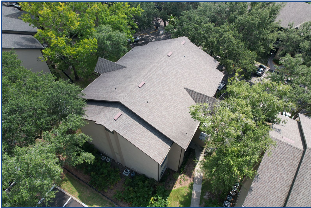
Photograph No. 2: West elevation.