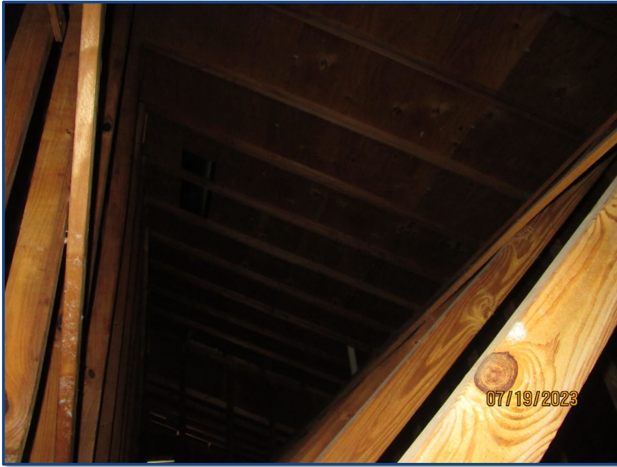
Photograph No. 5: General view of the prefabricated wooden roof trusses.