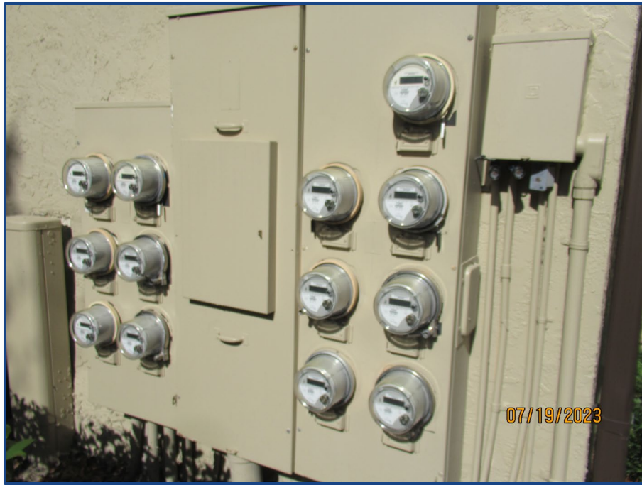
Photograph No. 19: Electrical meters.